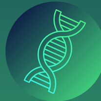
Cellular & Molecular Biology