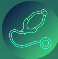
Anatomy & Physiology