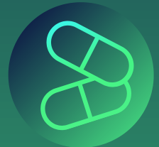
Pharmacology & Toxicology

Each area has its own exam. Participants must indicate, at the time of registration, in which areas they wish to compete. Each area offers its own awards.